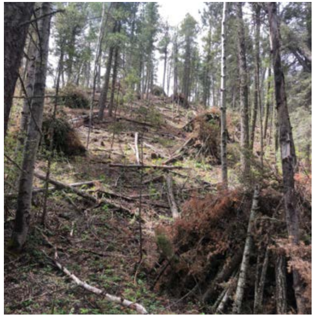
Hyde Park WUI Project.

For projects with such intensive impacts, the Forest Service is required to complete an Environmental Impact Statement (EIS). In the past, an EIS was completed for much smaller and less impactful projects. Under the Trump administration, the Forest Service was directed to log, thin and burn much larger areas of forest, as quickly as possible, with minimal analysis. That is what the Forest Service wants to do with our