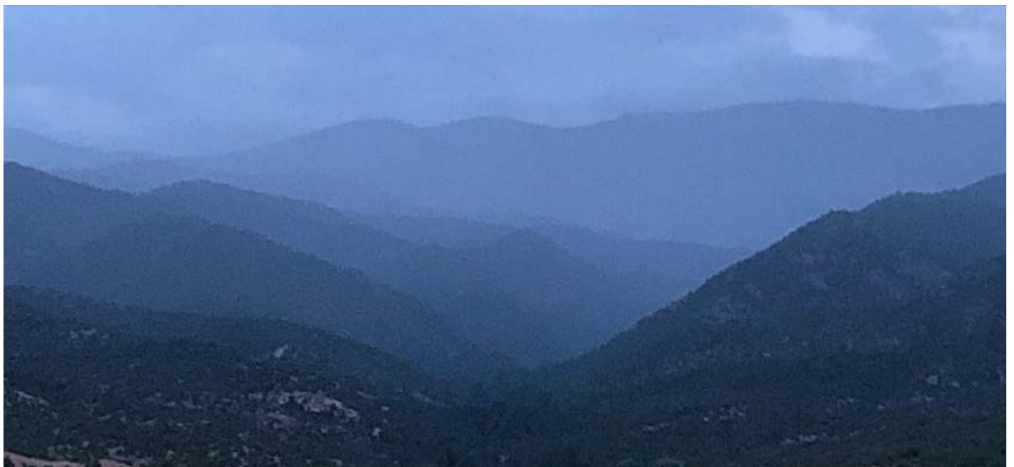
Prescribed burn smoke, Santa Fe Watershed.

The Forest Service must genuinely consider our health and systematically collect and document prescribed burn smoke health impact reports from the public. So far, they have not been willing to do so. It's up to us to tell them that they must fully evaluate the impacts on our health of so much burning. Our health matters.