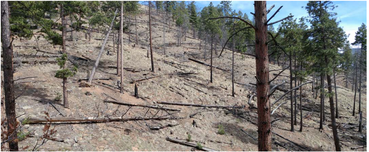
Santa Fe Watershed.