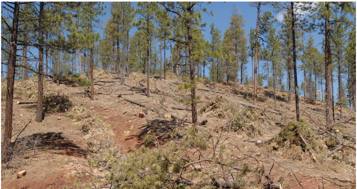
La Cueva Block A, 2019.

Simple observation of treated areas suggests that improved forest health has not been achieved, and in fact forest ecology has been greatly harmed.