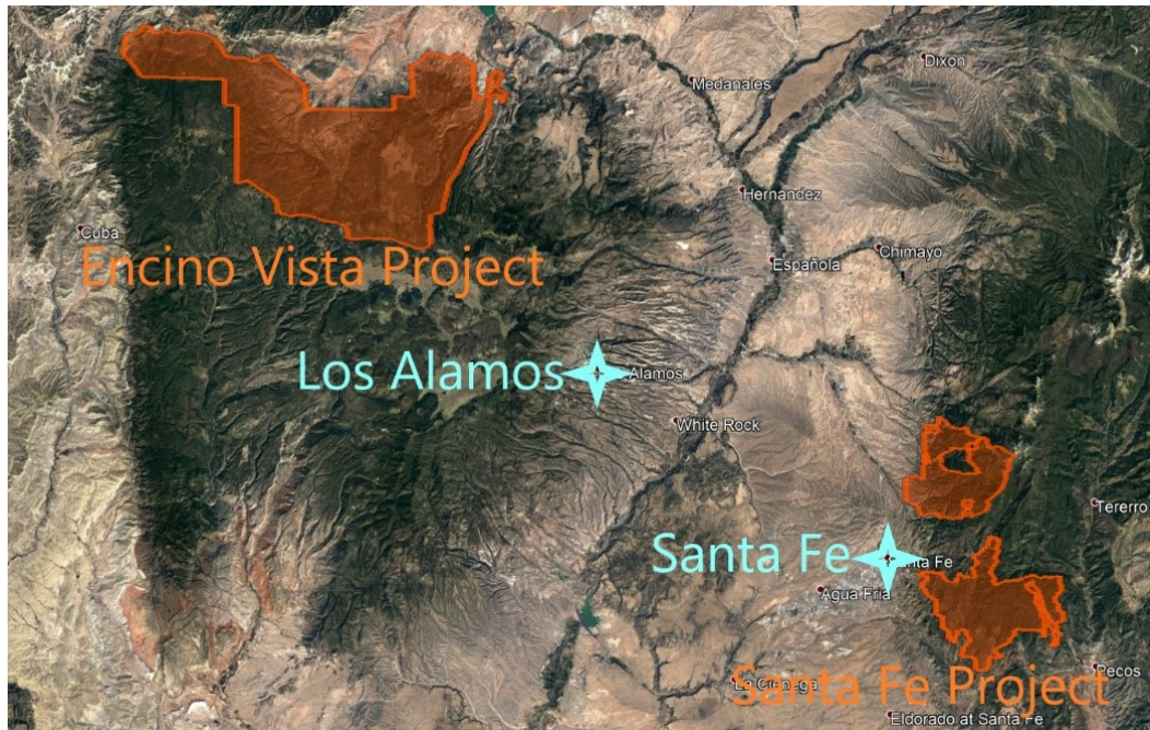
Satellite image background from Google Earth; project boundaries from US Forest Service