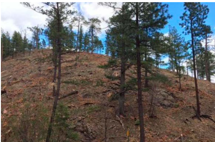
Gallinas Canyon near Las Vegas

We must defend our right to be genuinely involved in decisions about our forest. During the current draft environmental assessment comment period, we must demand an Environmental Impact Statement . Check theforestadvocate.org for further information.