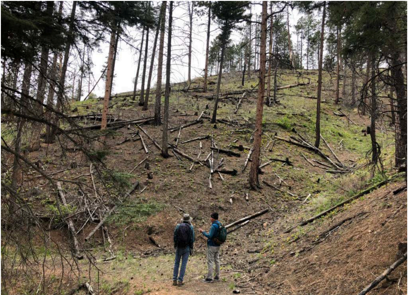
Santa Fe Watershed, thinned in 2002 and burned twice.

Two very large-scale fuel treatment projects are in planning now. We must engage, educate ourselves about these projects, and understand the ecological and health issues involved to help protect our forest and ourselves. We can make a difference, but we must stand for the forest .